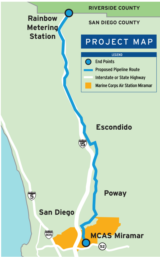
This map is for illustration purposes only. Map is not to scale. © 2015 San Diego Gas & Electric Company. All copyright and trademark rights reserved. Printed on recycled paper. S1540055 0815 XM